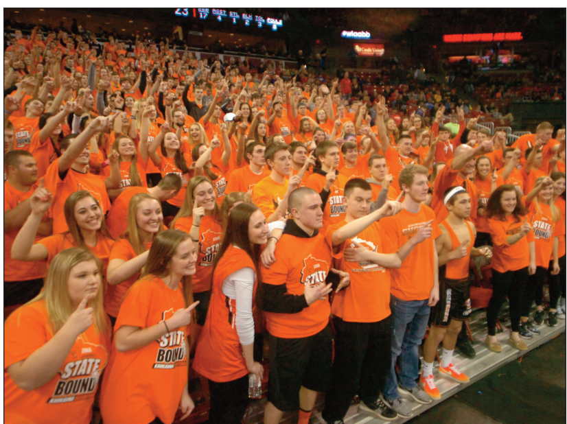
Students cheer during the semifinal game.

For more photos and extended coverage of Kaukauna's state basketball championship, visit Facebook.com/KaukaunaCommunityNews